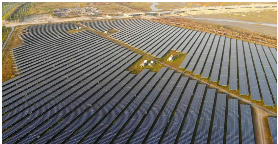
Actual site photos